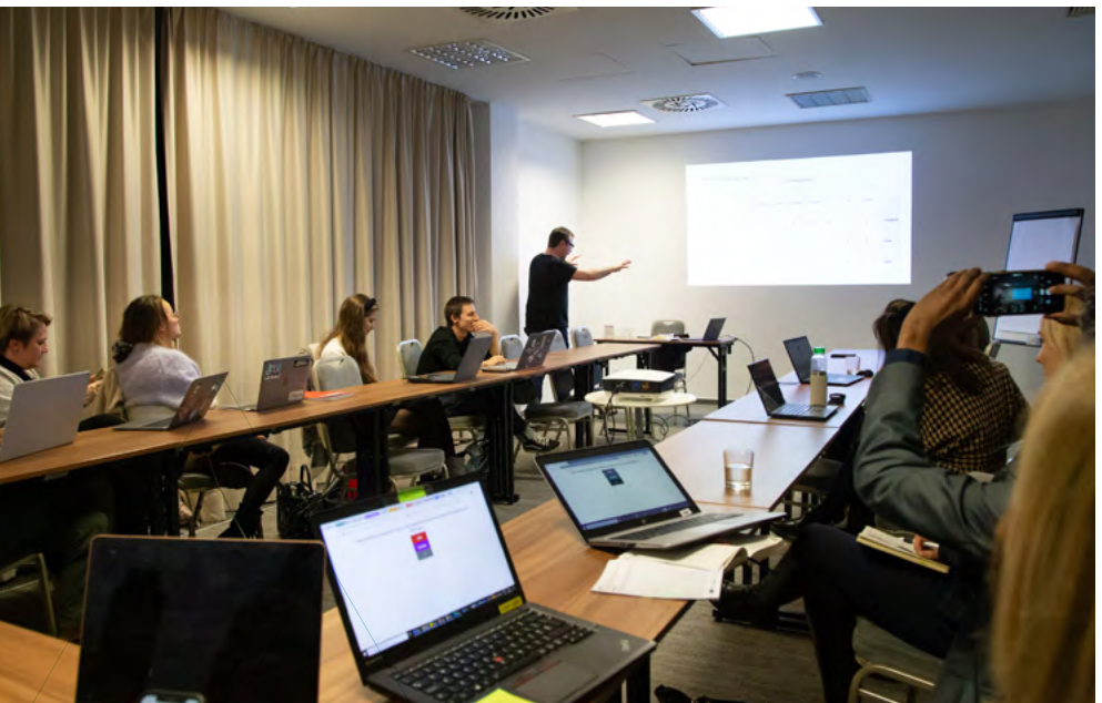
Photographs in Annual report are from PDCS conference, November 2022.